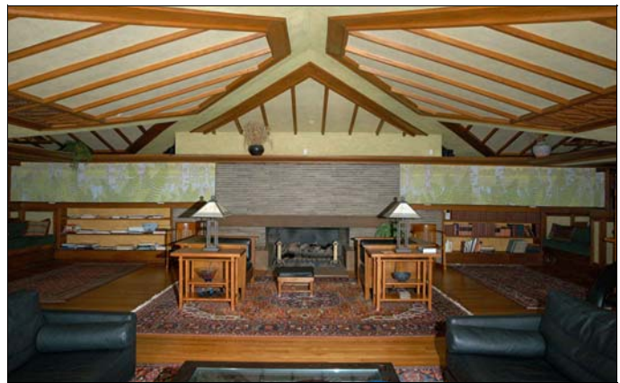
The interior evokes the open spaces and big sky of the Prairie.