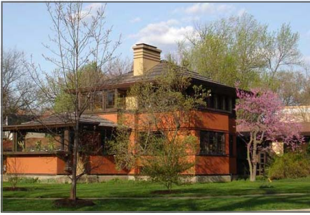
Thorncraft House, Prairie Style

being surprised by an envelope in the mail that contained photographs of their entryway and foyer circa 1900.