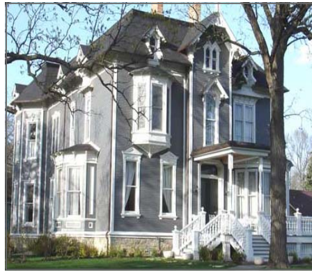
Allen House, Swiss Gothic