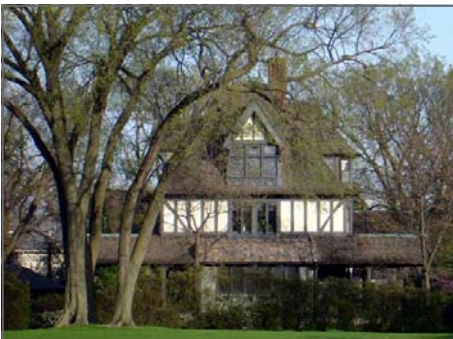
John F. Palmer House, Tudor Shingle

The documents showed that area was originally clad in oak paneling. They have reconstructed the oak paneling and beams to return the entryway and foyer to its original grandeur.