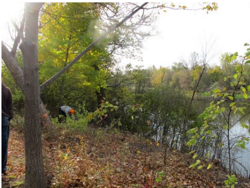
Riverside Road – Before

The two workdays at Scottswood Commons were also quite successful. The April workday included an Arbor Day celebration where 20 volunteers weeded, mulched & helped to plant a tree donated by the FLOS Landscape Committee. The June workday included 12 hardy volunteers who spread mulch on the various beds. One more workday is scheduled here so please consider joining us.