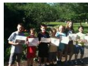
Blythe Park Winners

These students were treated to framed certificates and sizable chocolate bars iced with the Society’s trademark oak tree. First place winners also received a cash prize.