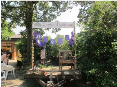
4 th of July