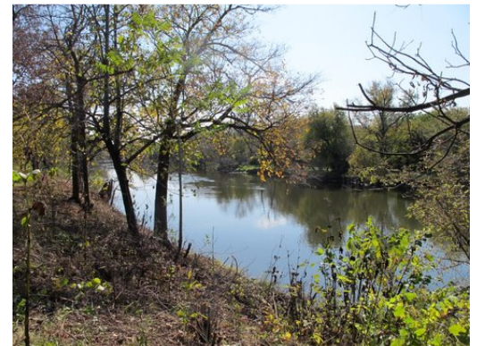
Riverside Road – After

Ten volunteers met at the May workday along Riverside Road to remove weeds & 9 volunteers helped plant the hundreds of plugs on the riverbank in June. The view along this portion of the DesPlaines River is astonishing.