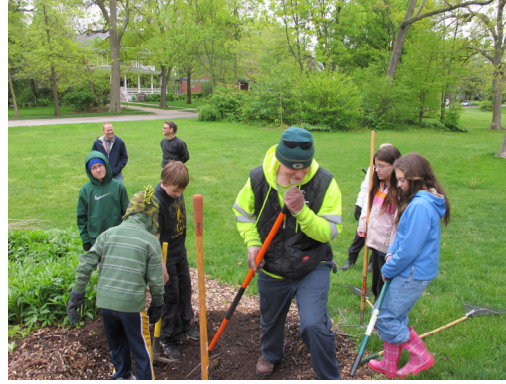
Arbor Day – Volunteers Planting a Tree