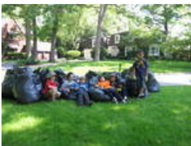
Celebrating with 27 Bags of Garlic Mustard

All together, so far in 2012 landscape workday volunteers have logged more than 330 hours making our green spaces more assessable & more pleasing to the senses. Volunteers make a difference. Join us!