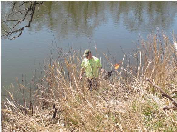
Burning along the Desplaines River