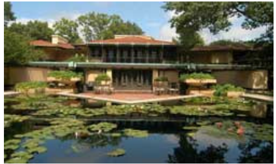
Avery Coonley Residence (Frank Lloyd Wright, 1908) The spectacular, meticulously restored main residence on the elaborate Coonley estate in Riverside, IL.