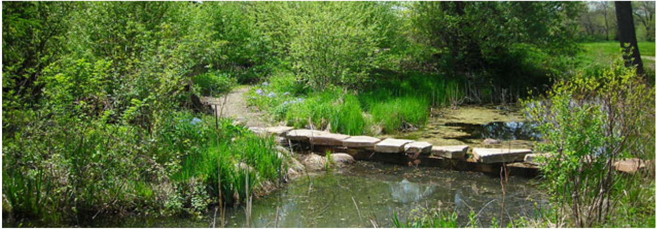
WASHINGTON PARK, CHICAGO IL

The Olmsted Society recently stated an objection to the use of Washington Park or Jackson Park as a site for the Obama Presidential Library.