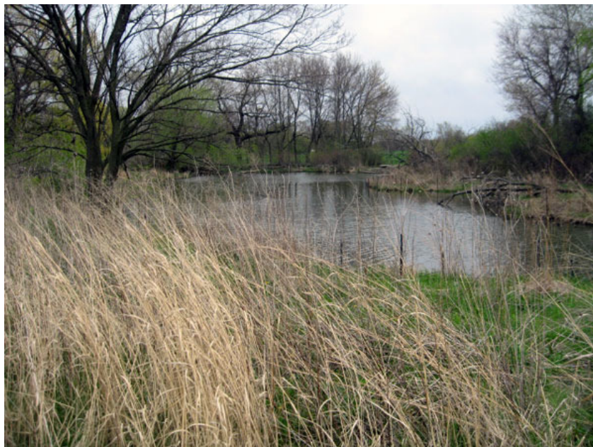
JACKSON PARK, CHICAGO IL

FLOS welcomes your opinion at newsletter@olmstedsociety.org .