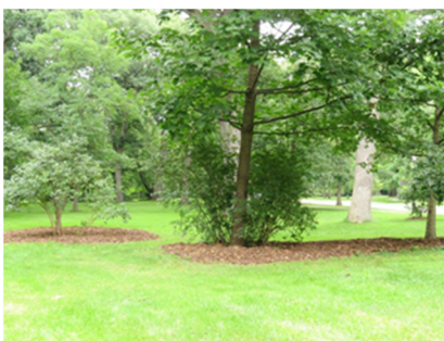
Scottswood Common after our Workday