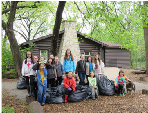
Troop 41020 at the Garlic Mustard Pull