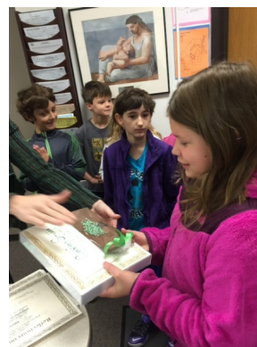
CENTRAL SCHOOL 3 RD AND 4 TH GRADE WINNERS