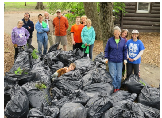
Our Garlic Mustard Haul

All workdays are scheduled for Saturdays from 9am-12pm. Look for the Riverside Public Works dump truck. Come for an hour or three, whatever your schedule allows. Supervised children are welcome. Service hour credits are available. Bring your favorite work gloves and a water bottle. All other supplies and snacks will be provided.