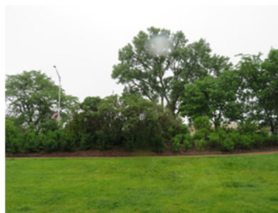
Patriot's Park after our Workday