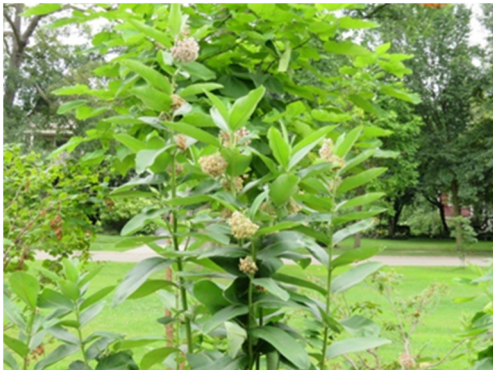
Milkweed on Scottswood Common

Over two very hot and humid workdays in July, FLOS volunteers cleared beds of weeds, invasive species and applied mulch to beautify the common. And, as a bonus, milkweed is growing profusely attracting monarch butterflies.