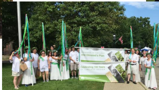
FLOS members march in Riverside's 4th of July Parade