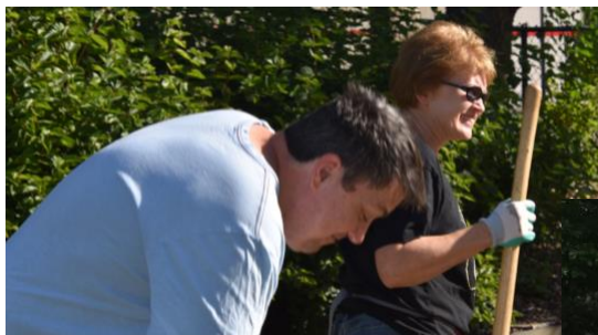
FLOS volunteers dig in at Patriots' Park

Please continue to join in the Olmsted Society's mission as "stewards of the land and Olmsted's Plan."