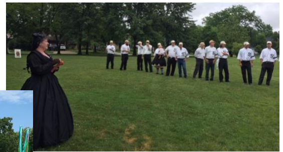
Vintage baseball returns to the Big Ball Park