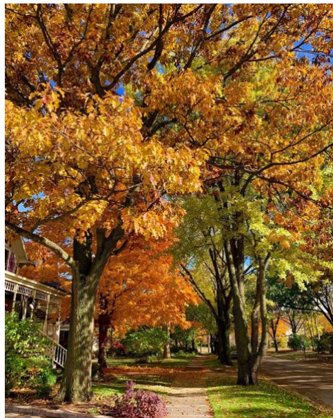
Autumn in Riverside can be a time of clear, bright days and vibrant colors!

Meanwhile, take care of you and yours. There is light ahead.