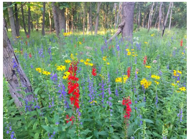
Somme Woods Nature Preserve in Northbrook, Illinois before (left) and after ecological restoration efforts