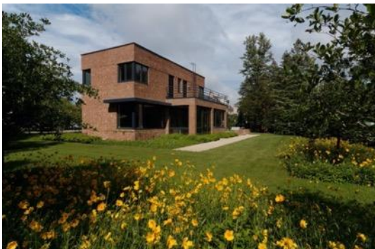
The Benda House and garden.