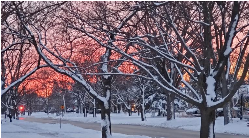
Longcommon Road late on a snowy afternoon.