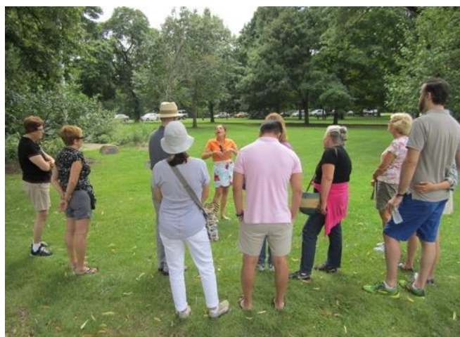
Visitors and residents (both new and long-time) enjoy walking tours led by FLOS guides.

Special customized tours are available by appointment. For more information call 708-447-7635 or e-mail tours@olmstedsociety.org .