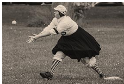
The Chicago Salmon return to the Big Ball Park on Saturday, May 20 for vintage baseball in a re-match with the Blue Island Brewmasters.