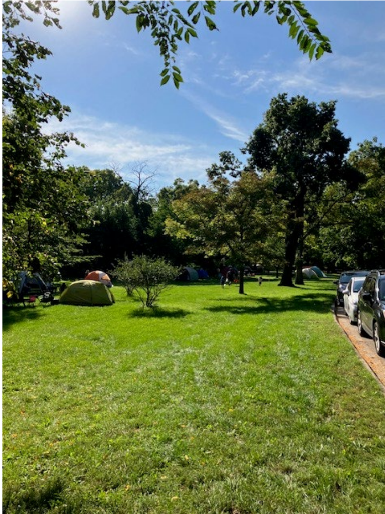
Proposed disc golf site includes greenway between Scout Cabin and Indian Gardens ballfield. Shown here with Scouts' tents and cars parked for baseball games.

“The Frederick Law Olmsted Society appreciates the considerable work that the Parks and Recreation Department has done to plan a disc golf course. We know they (and you) are committed to offering Riverside residents enjoyable opportunities to play and interact with our unique environment. Community enrichment through nature is part of Frederick Law Olmsted's philosophy of design. We do have several concerns about the siting of the disc golf course (not the game itself, but the proposed site).